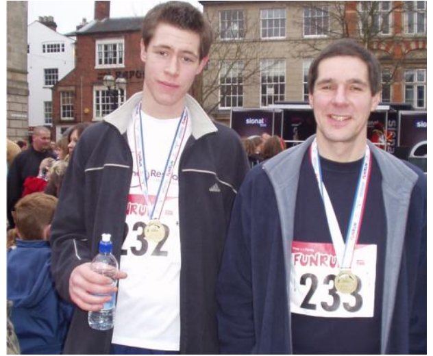
The Stafford Fun Run