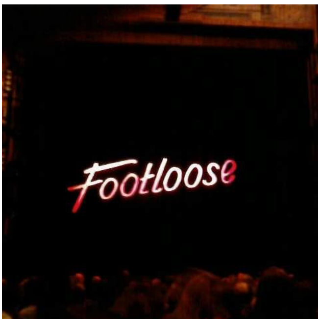
Waiting for the curtain to go up