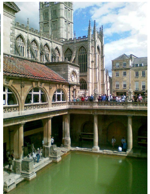
Romans Baths & Abbey