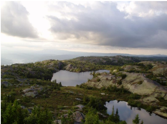
The top of Mount Nara (Norway)