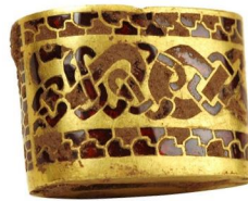
Hilt Fitting from the Staffordshire Hoard (including mud!)